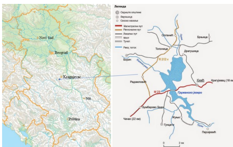
Fig. 1. Map of the sampling site (43.927888N, 20.678524E) at the Gruža Reservoir

Germany, 10:2, v/v) at 200 °C for 20 min. After cooling to room temperature and without filtration, the solution was diluted to a fixed volume of 25 ml with ultrapure water.