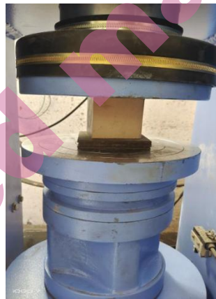
Fig. S3. Compressive strength testing of MOC block by UTM machine.