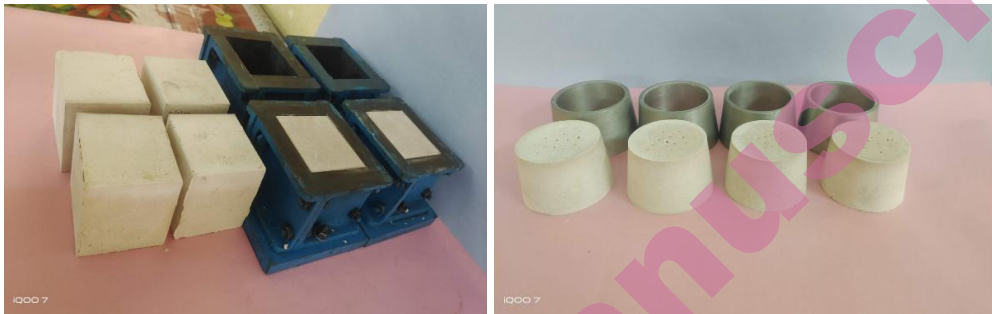
Fig. S2. Compressive and setting time blocks without cracking.